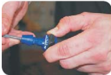
Twist release to change file

Product Code #DY89320025 Iron Claw Ergo Grip Mini (All files listed below)