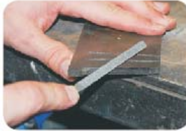
Use on all carbon and stainless steel