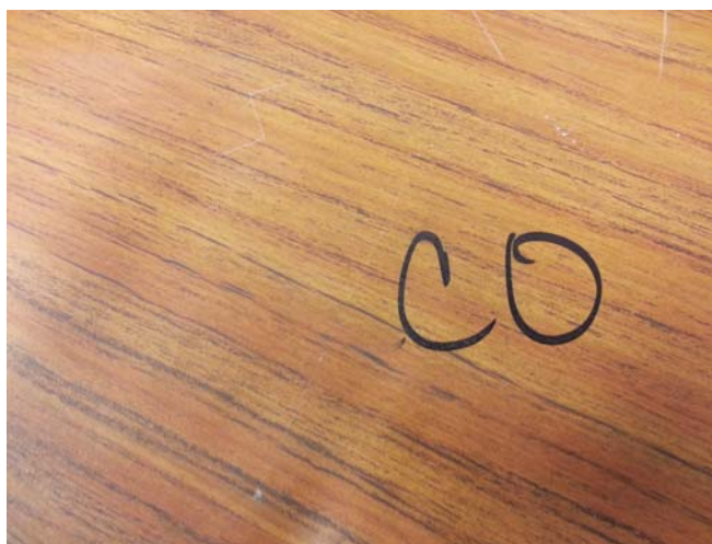
Removed with DUZ-IT-ALL

Call your Superco Sales Representative for a product demo of DUZ-IT-ALL - It really DUZ!